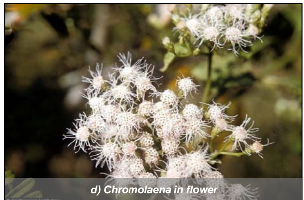
d) Chromolaena in flower