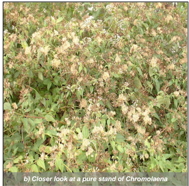
b) Closer look at a pure stand of Chromolaena