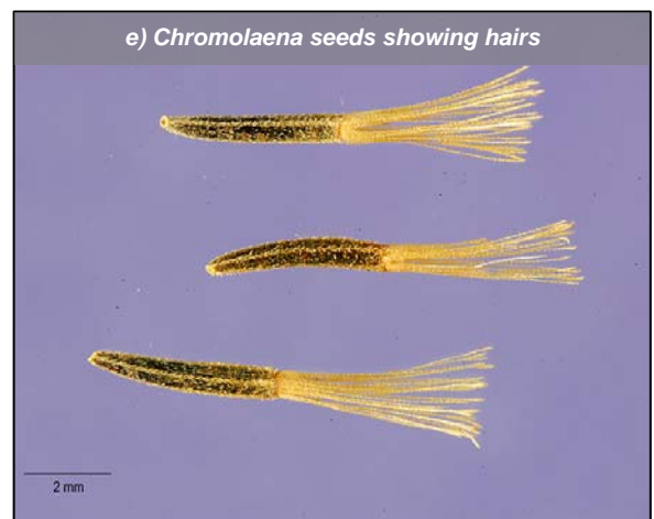
e) Chromolaena seeds showing hairs