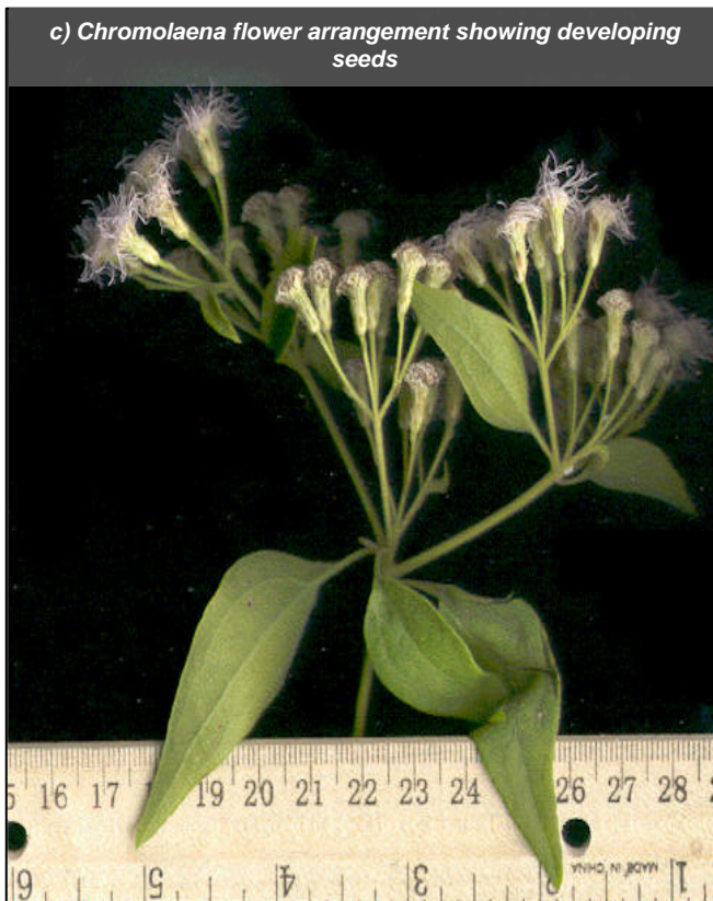
c) Chromolaena flower arrangement showing developing seeds